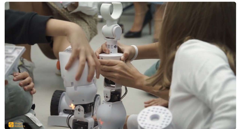
Welcome in Smart Lab Caro (INACO & ShapeRobotics)